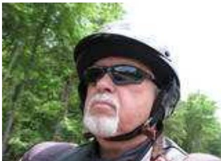
No, he does not work at Orange Count Choppers!