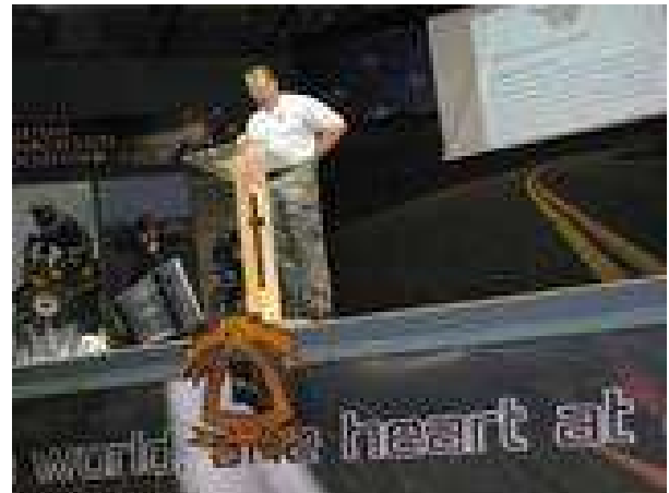
Randal says, "You've got to change that Stinking Thinking!"