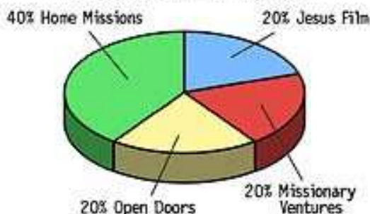
RUN FOR THE SON Breakdown of Funds

It seems like a long time from now until May 1st, but it will be here before you know it. It would be great if the chapter could raise a lot of money to support the CMA . . . And we can. We just have to find ways to make money, get some donations, yard sale, etc. If anyone has a good idea to raise money for the CMA this year let us know.